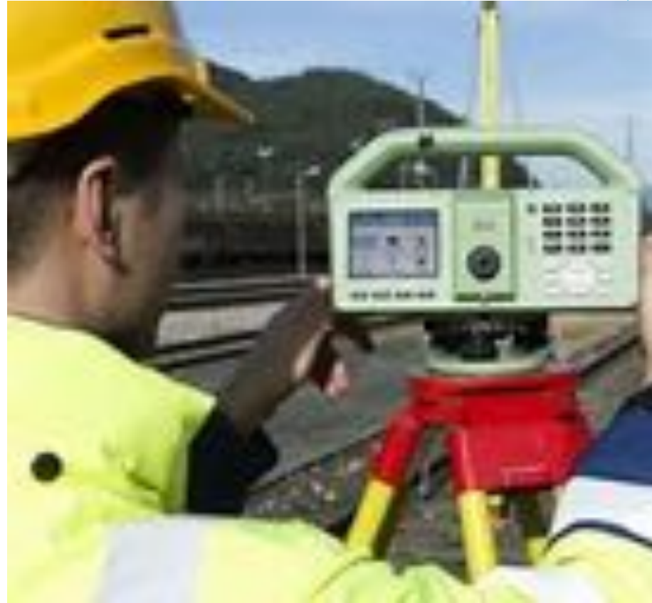
DIGITAL LEVEL 0.3mm Accuracy