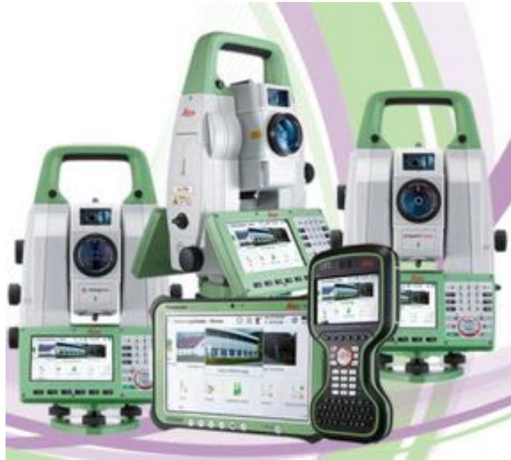
TS16/MS60 CAPTIVATE SERIES