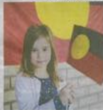
Lilla waves the Aboriginal flag. (1/17/17)