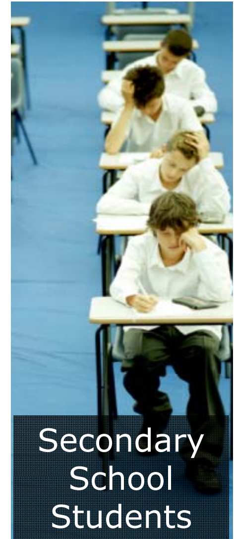
Secondary School Students